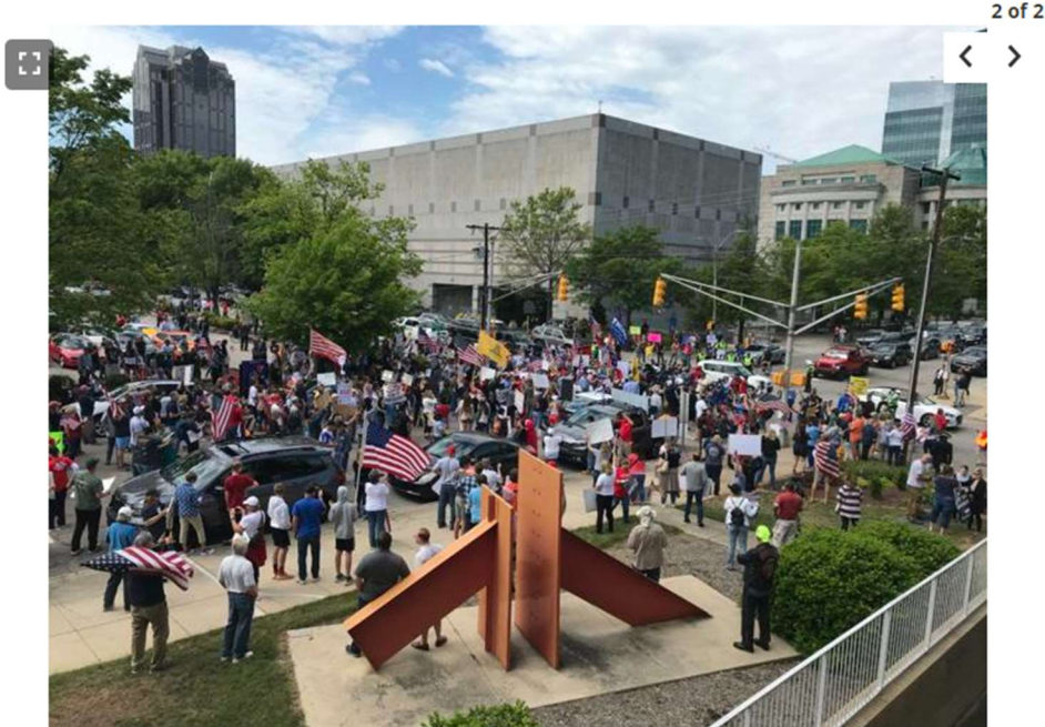
Participants at the April 21 ReopenNC rally gather near the Legislative Building awaiting an escort from Raleigh Police Department motorcycle officers.