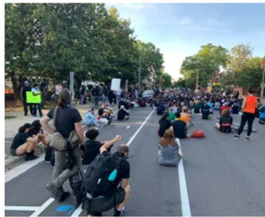
The scene outside the Executive Mansion on June 1, 2020

The protests turned violent over the weekend – resulting in several arrests and destruction across the city.