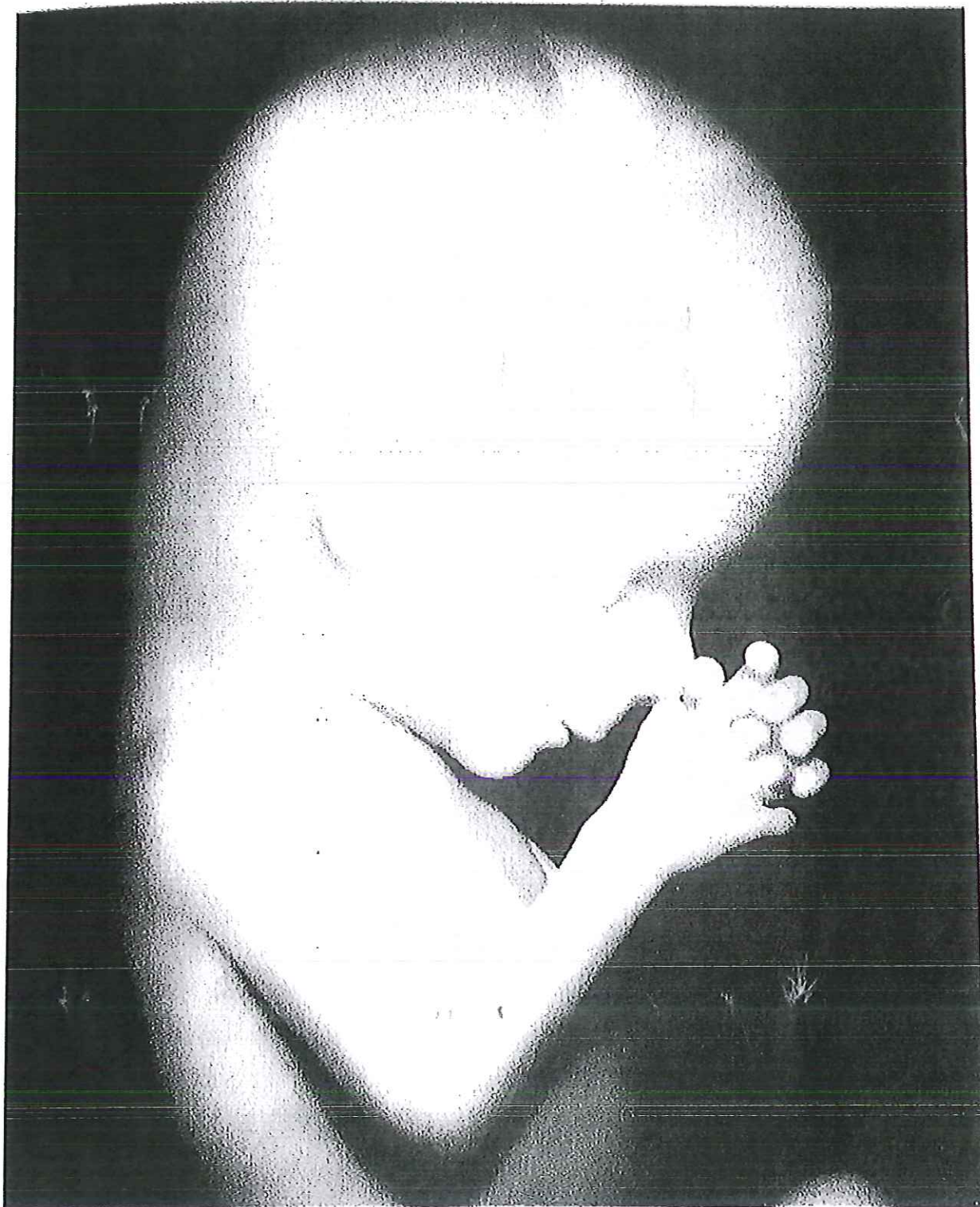
Fig. 6.5 Enlarged photograph of the head and superior part of the trunk of a 13-week fetus. ✓