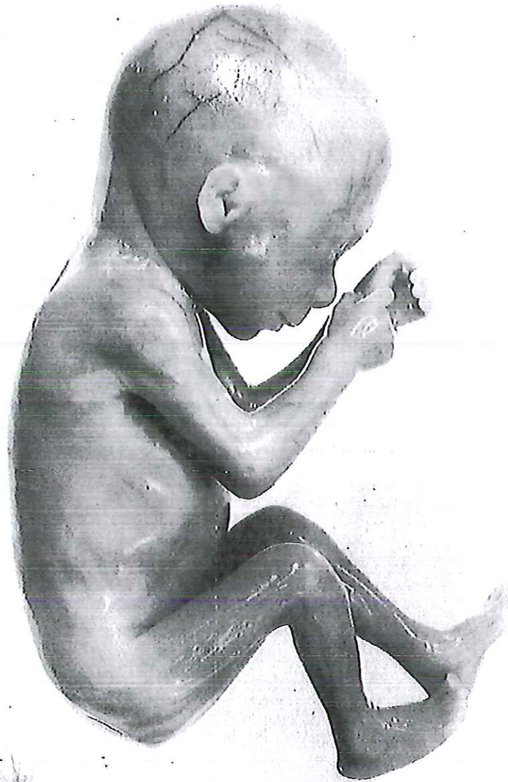
Figure 6-8 Photograph of a 17-week fetus. Actual size. Note that the ears stand out from the head and that no hair is visible. Since there is no subcutaneous fat, the skin is thin, and the blood vessels of the head are visible. Fetuses at this age are unable to survive if born prematurely, mainly because their respiratory system is immature. The alveolar surface area is insufficient, and the vascularity of the lungs is underdeveloped.